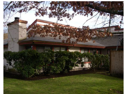
The entry courtyard to Mountain House, site of the future Mountain House Memorial Garden