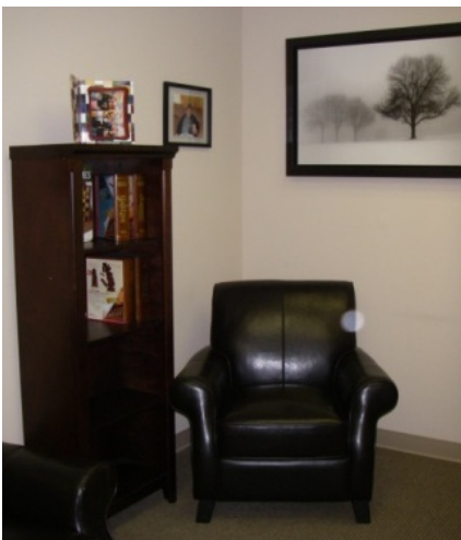
Cameron's Corner is a comfortable place to get away from it all and just relax